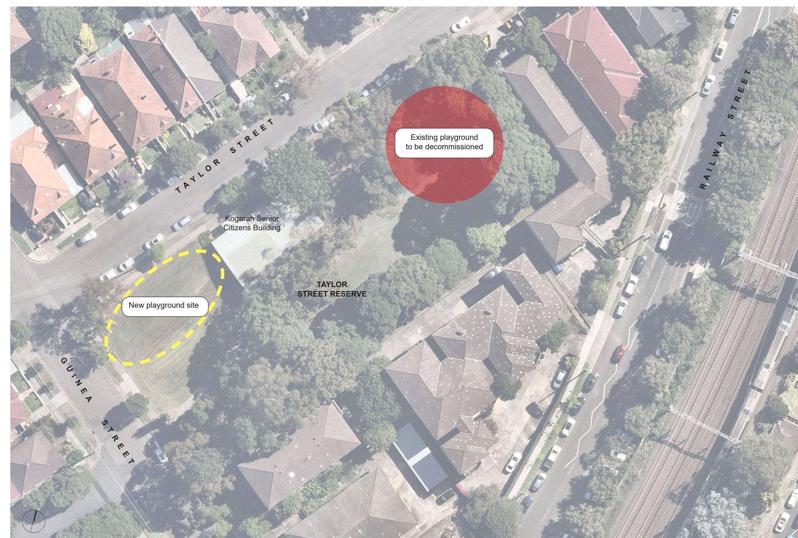
TAYLOR STREET RESERVE PLAYSPEC PROPOSED WORKS