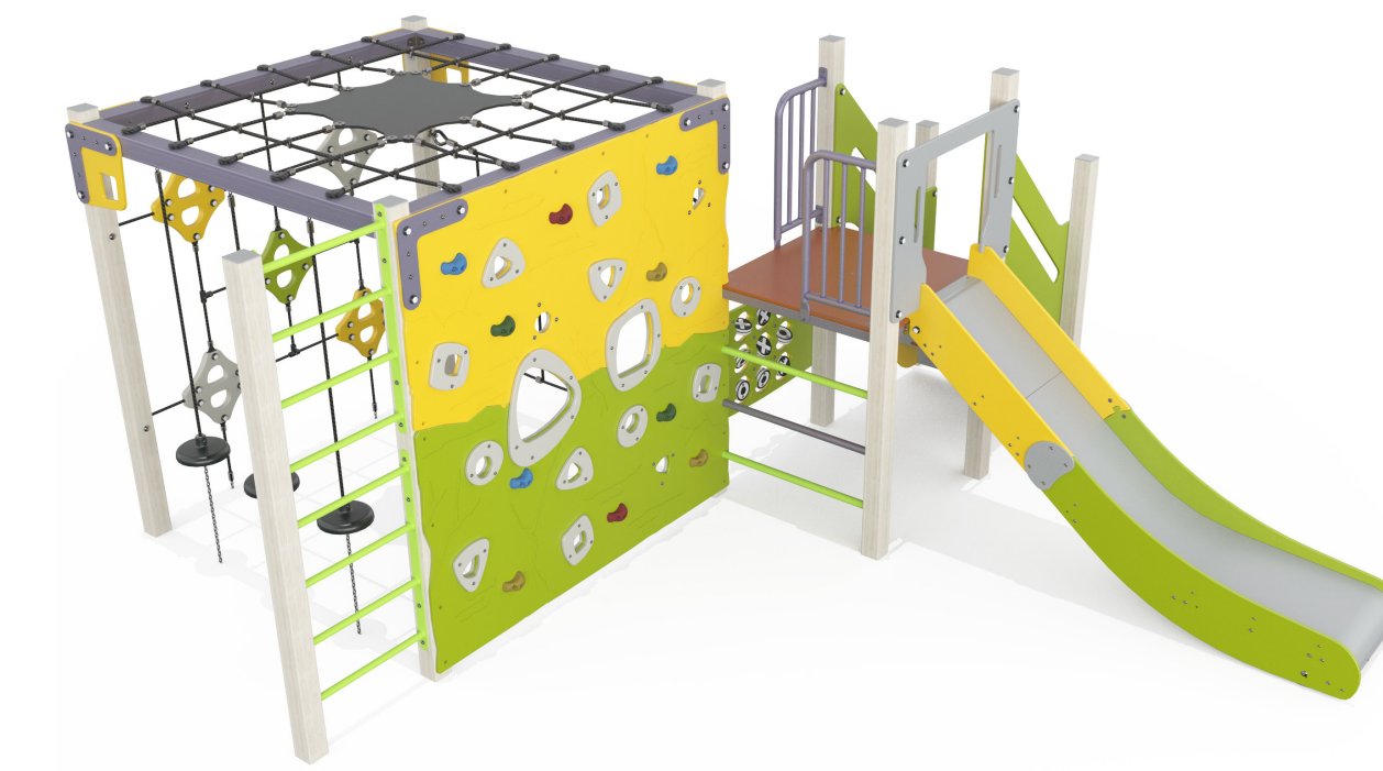
NEW PLAY EQUIPMENT