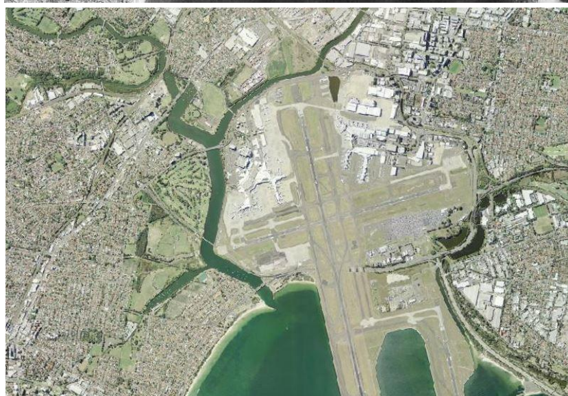
Satellite images of the Cooks River in 1943 and today.