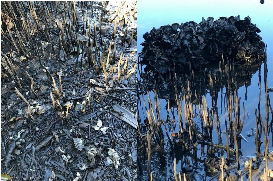
Cooks River viewed from Cahill Park