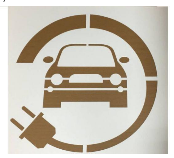
Figure 4 - 'Electric Vehicle Parking Only' within the parking space