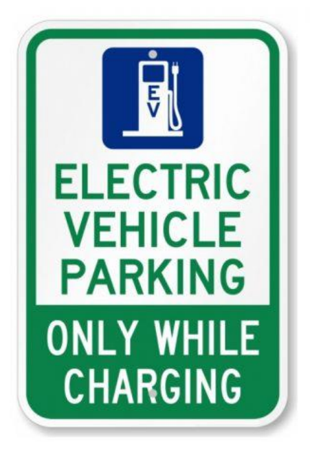
Figure 5 - Preffered parking space signage