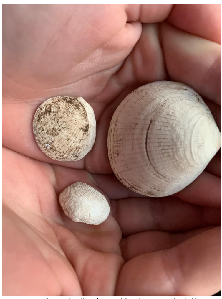
Image 1: Sea shells I found in the sand at Sir Joseph Banks park June 2022

Sir Joseph Banks park was once the beach! When Port Botany and the airport were built all the sand was moved from the water and made the park area. This is called 'reclaimed land'. The whole park is sandy still and if you are lucky you can still find some sea shells in the park!