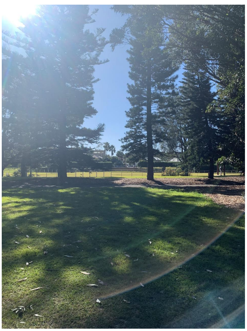
Image 6: What the running track looks like now June 2022