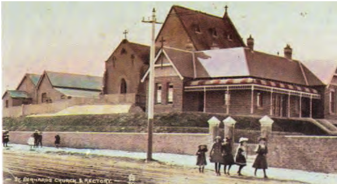
Fig. 6.0.12 Pre 1895 photograph showing the original buildings of St Bernard's, including the (L to R) schoolroom, convent(at rear), bell tower and the 1860 church. (BCHA)