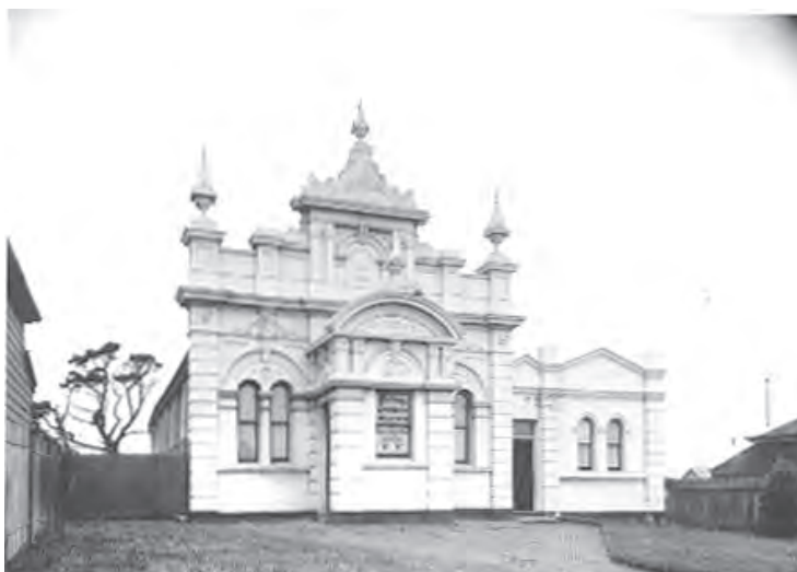
Fig 6.0.17 The Literary Institute building, also known as the School of Arts building, at 1361 Botany Road, Botany c.1930s.

The Institute was established for the education and betterment of the local working population, and provided a reading room with small library.