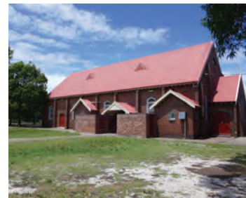
Fig. 6.0.15 St Michael's Church built in 1924 was also used as the schoolhouse until the purpose-built school was completed, requiring the re-organisation of the interior twice each week to accommodate the two uses. The original church building remains and is now used as a hall. (Elizabeth Conroy)

The origins of the school actually begin in Kensington, where in 1914 it was announced that sisters from the Our Lady of the Sacred Heart convent at Kensington would begin a small school in a hall (although in reality it was more akin to a shed) situated at the corner of Anzac Parade and Wallace Street. There were 42 pupils at first, but this number quickly grew. In 1919 the Daceyville subdivision began and the Daceyville Parish was formed soon after. There was a large block of land purchased by the Catholic church for use by the Parish at Daceyville. Construction of a new Church-School building upon the site began in 1920.