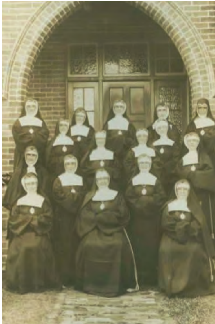
Fig 6.0.16 Sisters of Our Lady of the Sacred Heart at their convent, beside St Michaels Catholic Primary School on Haig Avenue c.1920s

The learning environment was very trying in St Michael's early years. By 1924 the Church-School building had been completed (it remains today on the site, close to the boundary of Haig Avenue), however its use had to be shared for many years, meaning that after each school day the front part of the building had to be reorganised in preparation for the next morning's Mass, and each Friday, the entire school was reconverted into a Church for the Sunday congregations.