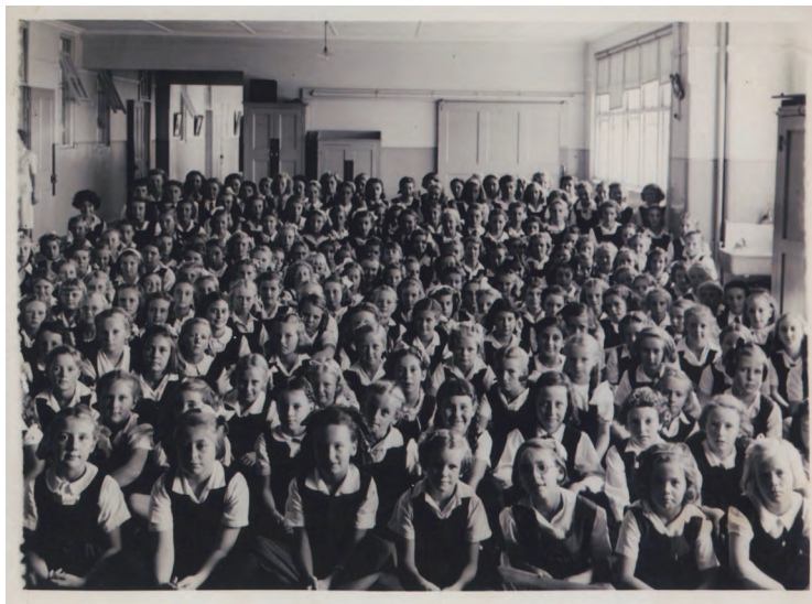
Fig 6.0.9 The original temporary Daceyville School was located in Astrolabe Road. Photo taken c. 1914-1917s.