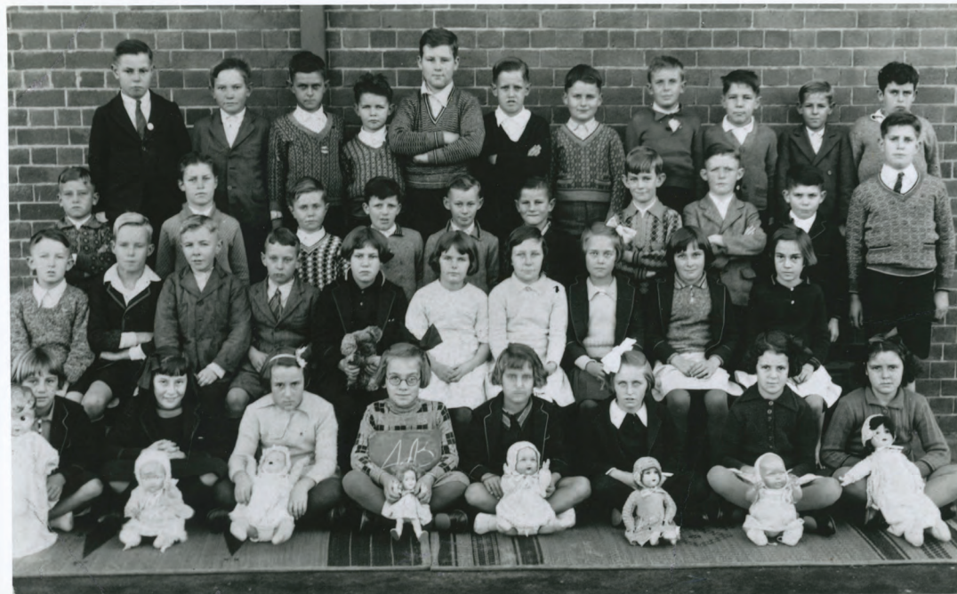
Fig. 6.0.5 Class 4B and their dolls at Mascot Public School. n.d.(BCHA)

The school, built of brick with an iron roof in the Arts and Crafts style,