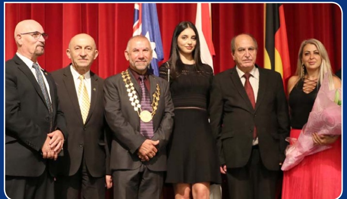
Mayor Joe Awada and members of the Lebanese community at Council's flag raising ceremony in celebration of Lebanese Independence Day.