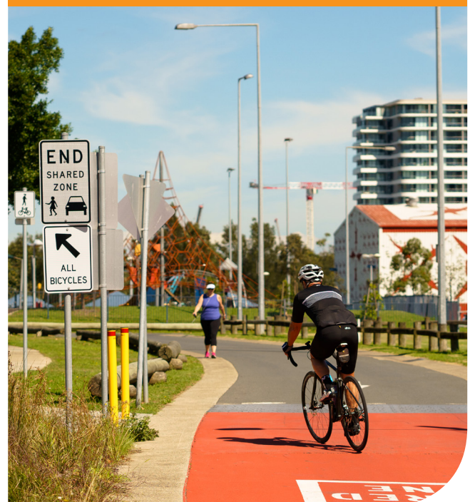
Shared cycle and pedestrian pathway, Tempe

We will work at night to minimise traffic impact and for the safety of our workers, motorists and the public.