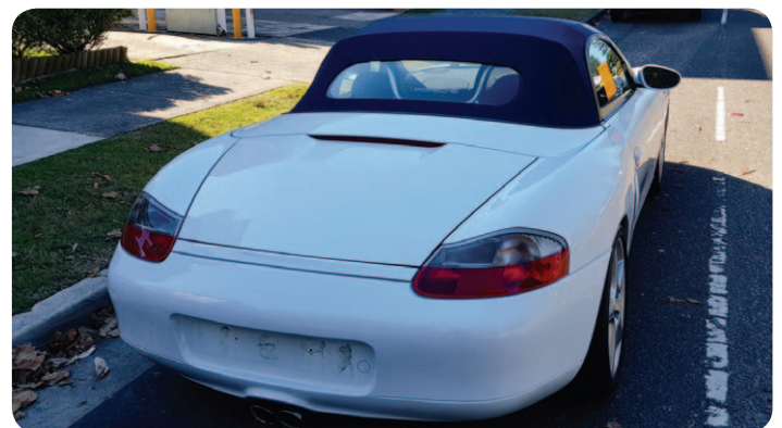
This Porsche Boxter was, surprisingly, one of the abandoned vehicles.

When an unregistered vehicle was detected, Police removed the number plates of the vehicle and the Ranger attached an abandoned vehicle sticker, took photographs of the car and filled out the relevant documentation.