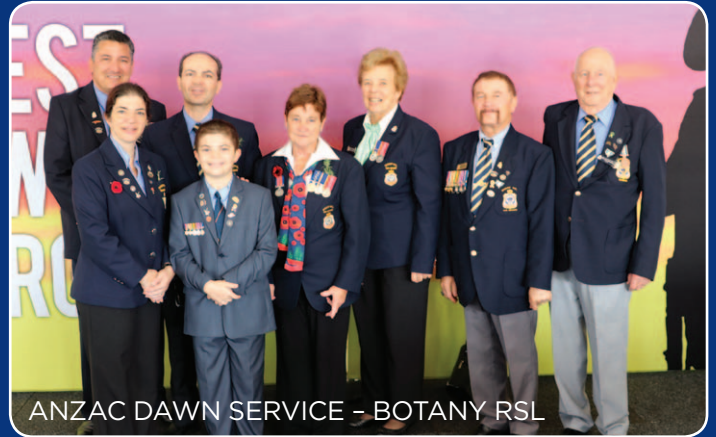
ANZAC DAWN SERVICE – BOTANY RSL