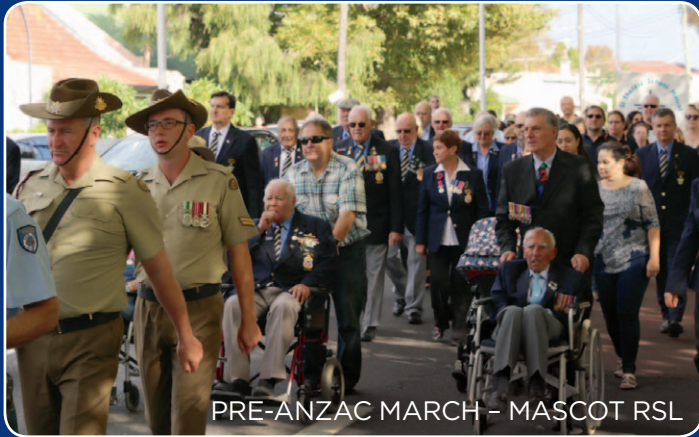
PRE-ANZAC MARCH – MASCOT RSL