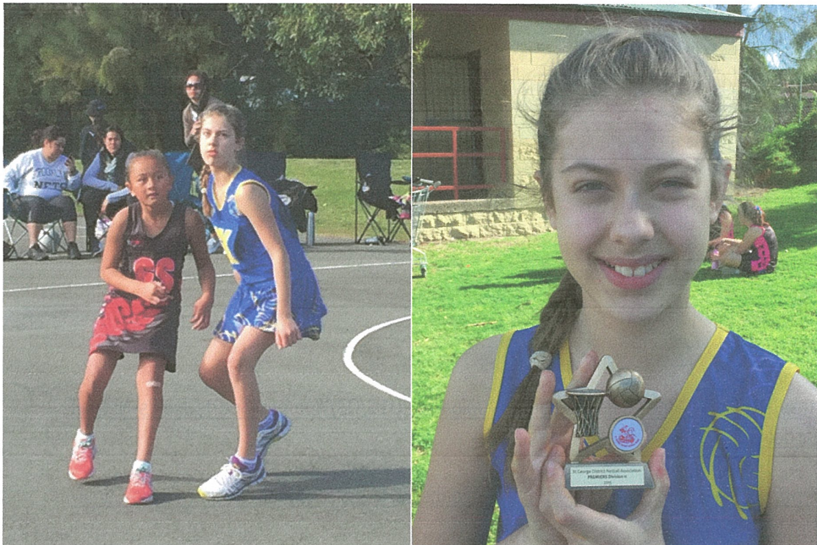
Me at Saturday netball game at Rockdale Women's Netball Courts (old Wilson Farm)

Now as I walk past Wilson's Cottage every Saturday, I am a fascinated observer. I look forward to seeing this cottage be restored to its former glory, some time in the future.