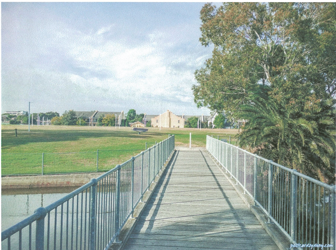
Muddy Creek Bridge connecting hard surface courts and grass courts