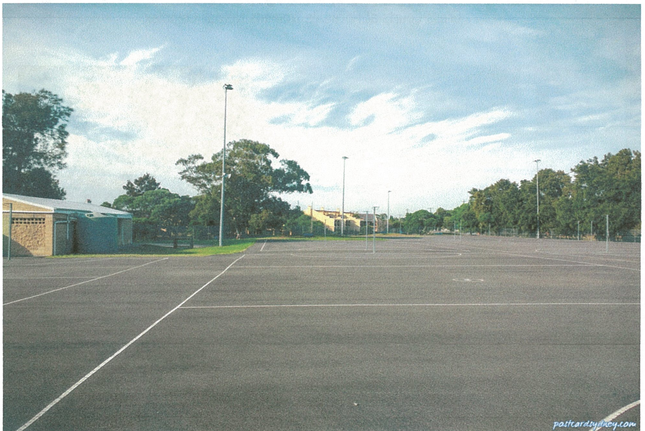
Rockdale Womens Netball Complex

In 2005, an agreement with Rockdale City Council was made to invest in another 15 hard surface courts (sealed) at a cost of $165,000. Also in the same year a new bridge was built over Muddy Creek with the help of Sydney Water and Frank Sartor MP. This later allowed more grass courts to be made and these are still played on today by the youngest age players. In 2013 the canteen was upgraded.