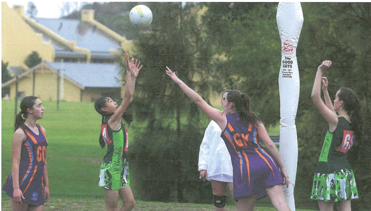
Women's Netball Courts today at 310 West Botany Street Rockdale

In addition, Wilson's Farm House is an important piece of our city's colonial past and as a result the cottage was heritage listed in November 1986. A year before this, Rockdale Council approved some restoration and refurbishment work of the cottage as it was in fairly poor