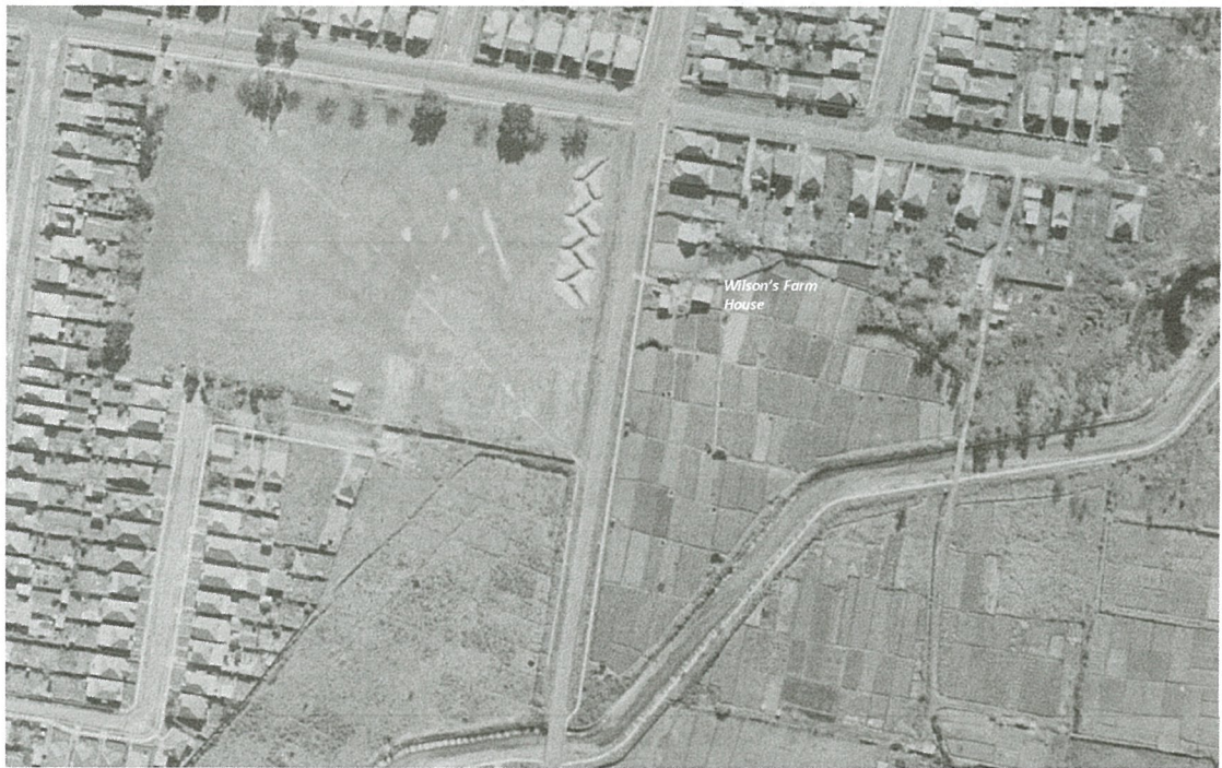
This aerial photograph was taken in 1943

When this Council was dissolved, it was automatically absorbed by the newly formed Rockdale Municipal Council. The council decided to make the land (under leasehold conditions) into a Market Garden which continued to be operated until the 1970's by Chinese immigrants.