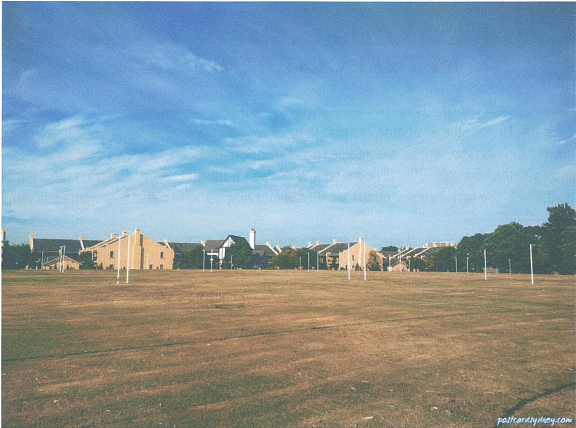
Grass Courts at Rockdale Womens Netball Complex