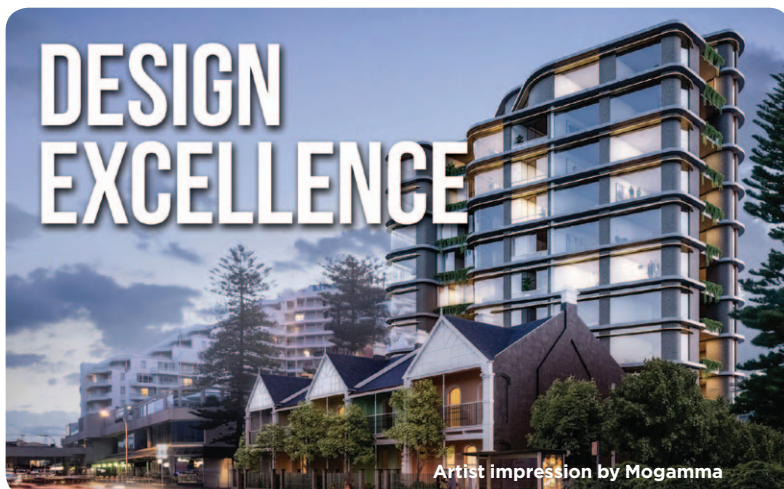
Artist impression by Mogamma

Bayside Council recently held a design excellence competition for 64 - 68 The Grand Parade, Brighton Le Sands.