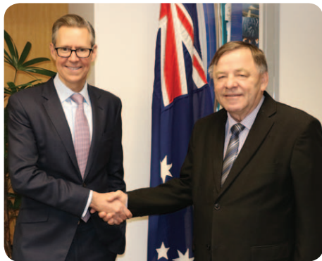
The Mayor Bill Saravinovski with Sydney Airport's CEO, Jeff Culbert.

Volunteers can sign up by visiting www.conservationvolunteers.com.au or contacting Conservation Volunteers Sydney on 9331 1610.