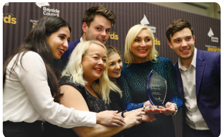
Recruitment Edge, winner of the Excellence in Professional Service Award.

Schools can distribute this money to a deserving student or students who have achieved in their specialist areas or who have made a significant and positive contribution to their school's culture and community.