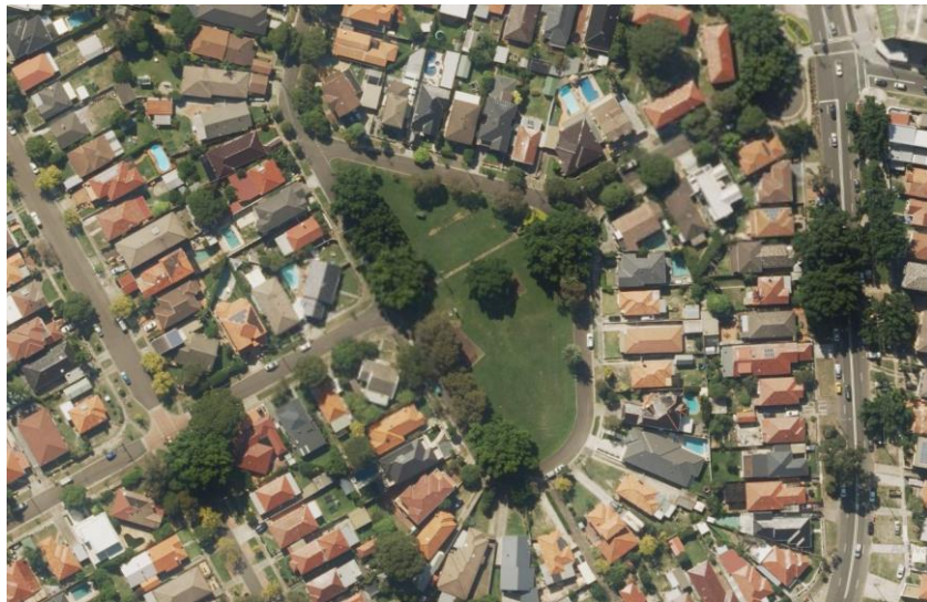
Glanville Avenue Reserve, Pagewood Six Maps