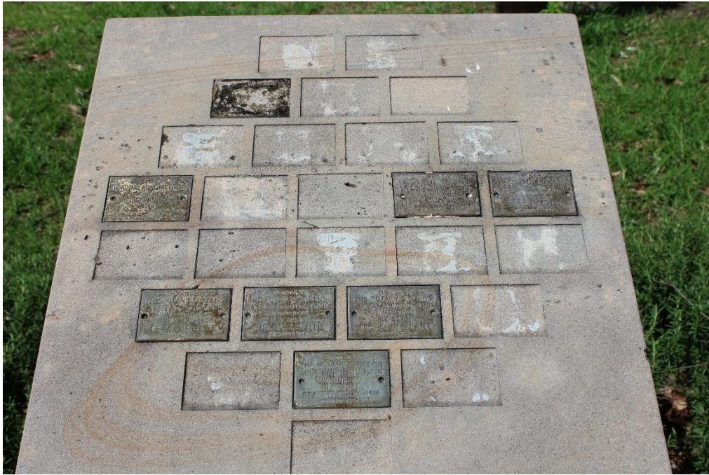
Arthur Park. October 2018