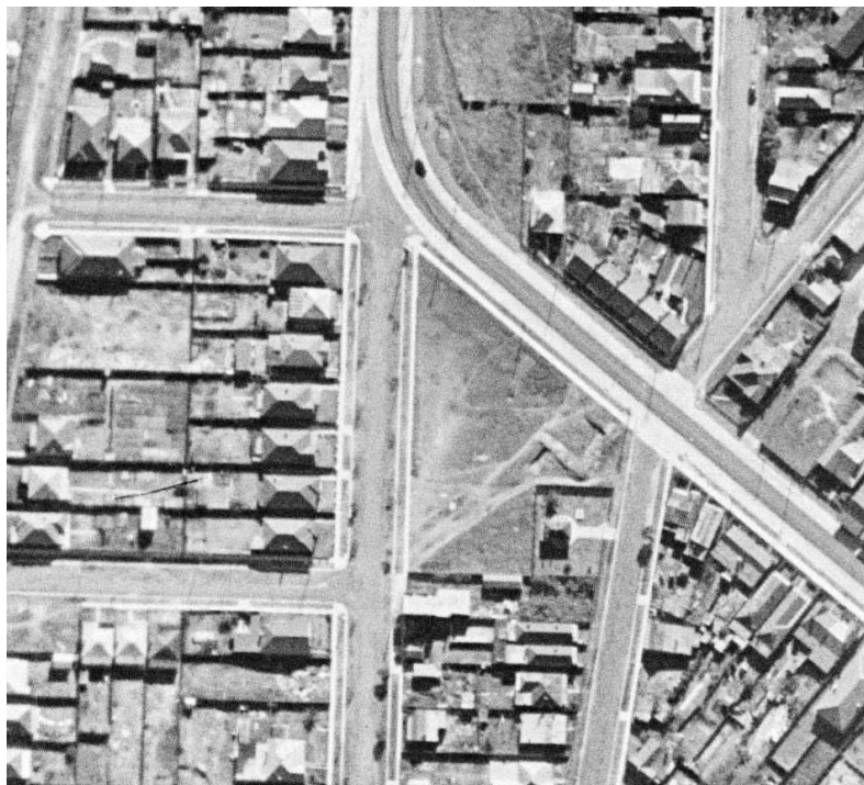
From Six Maps, 1943, showing the area of Arthur Park https://maps.six.nsw.gov.au/

The major part of Arthur Park, fronting Botany Road, was purchased by Botany Municipal Council in two parcels in 1936 and 1937. In 1945 the park was enlarged when land, not required by the then Metropolitan Water, Sewerage and Drainage Board (MWS&DB now Sydney Water) for a sewerage pumping station, was acquired by Council. The name Arthur Park was not yet in use at this time.