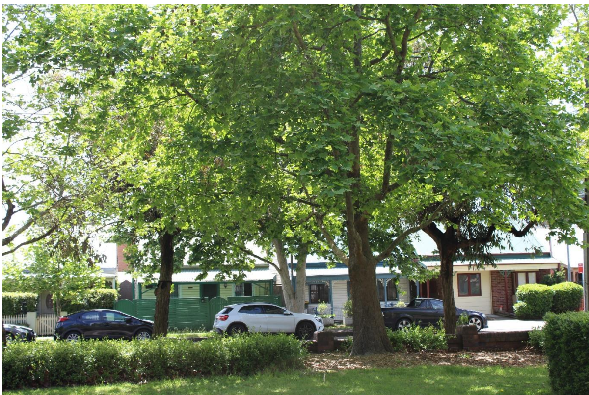
Approximately 10 poplar trees remain in Arthur Park. October 2018