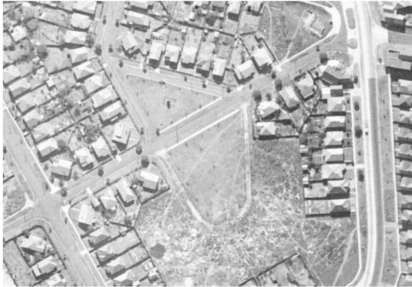
Glanville Avenue Reserve, Pagewood From Six Maps, 1943