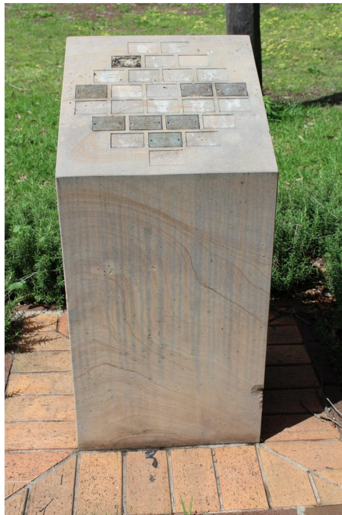
Arthur Park. October 2018