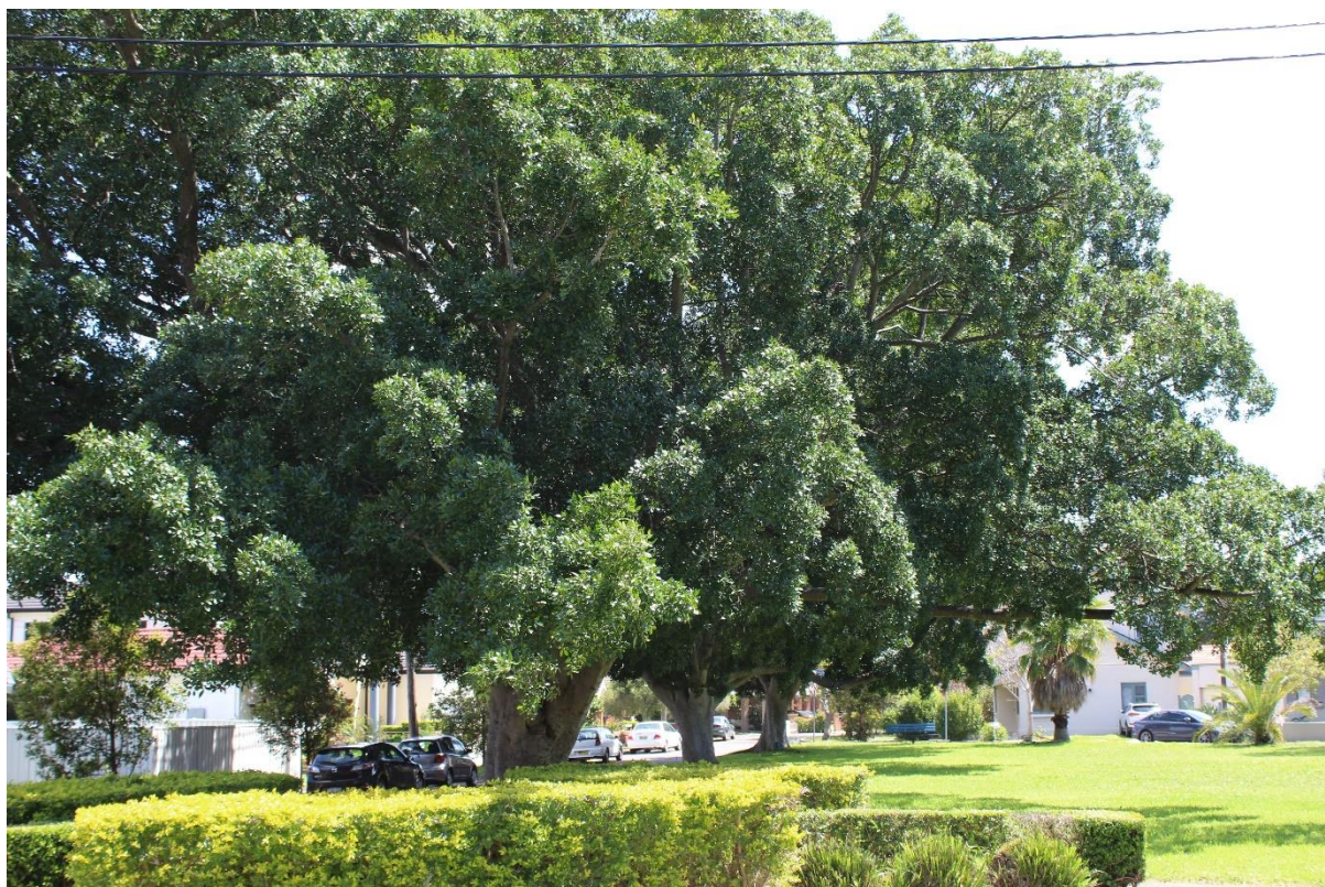
Glanville Avenue Reserve, Pagewood. October 2018