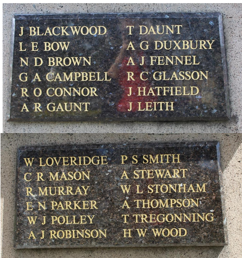
World War II names, Botany War Memorial, Booralee Park. October 2018