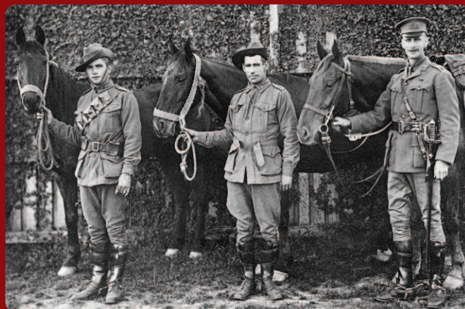
Some members of the 1st Light Horse Regiment took their own horses to the Front while others were provided with horses donated by the community or bought by the Government.

Rosebery Park Racecourse (now Eastlakes) was the staging ground for the 1st Light Horse Regiment of the 1st Light Horse Brigade during the early years of World War I. Today, a memorial to the Light Horse stands at the former entry gates of the racecourse which was re-developed during the 1960s. In 2015 the reserve in which it stands was renamed Light Horse Reserve.