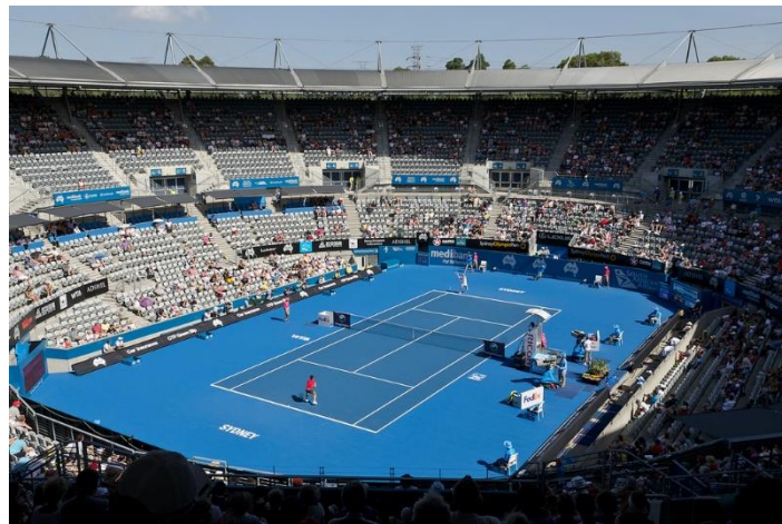
Ken Rosewall Arena

court at Sydney's Olympic Tennis Centre is now named 'Ken Rosewall Arena' in his honour.