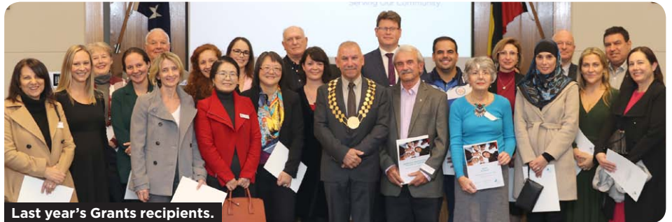
Last year's Grants recipients.